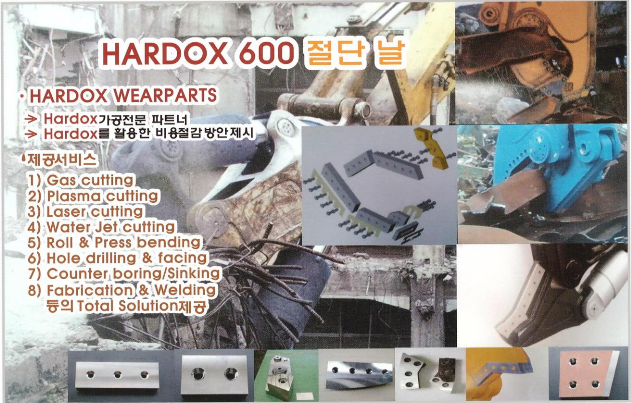
절단 콘크리트 절단용 칼날 ( Shear Blades) ● 일본 콘크리트 절단용 Shear Blades(DW series) ●