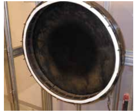
Result for sliding wear with crushed glass Service life relative to S235/A36

Hardox® Extreme performed well when tested with crushed glass from a glass recycling plant in Sweden. With a nominal hardness of 60 HRC (Rockwell) and typical hardness of 650-700 HBW, Hardox® Extreme outperformed the other tested materials. The high relative service life has also been confirmed in real-life applications.